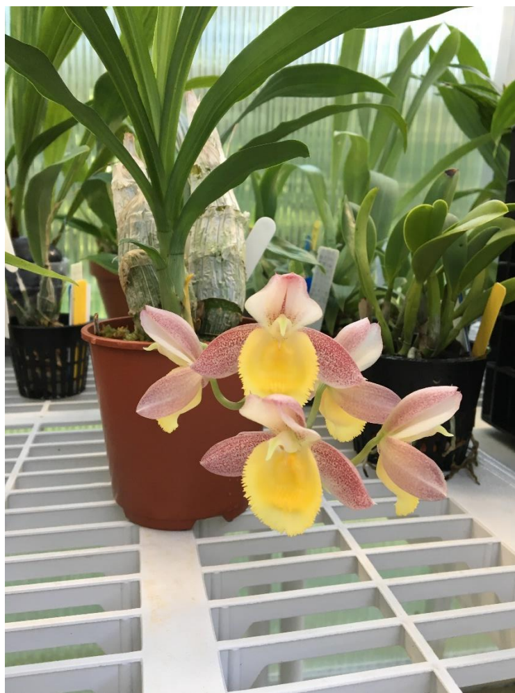
Catasetum Chuck Taylor back in Massachusetts