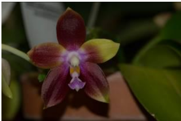
Phalaenopsis Tying Shin Flying Eagle Steve Steiner