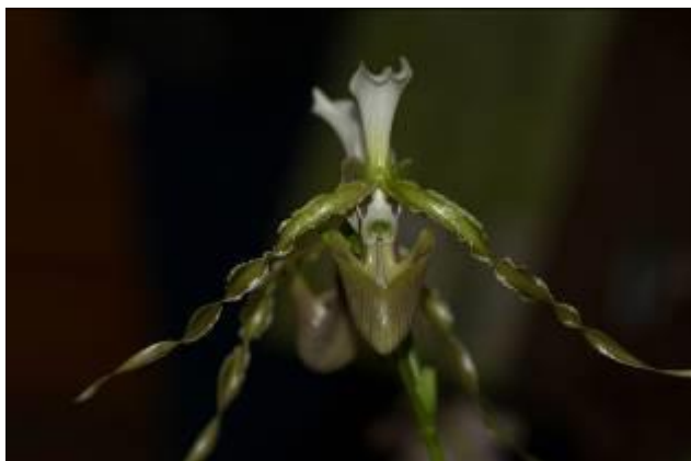
Paphiopedilum dianthum