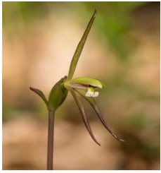
Greater Whorled Pogonia