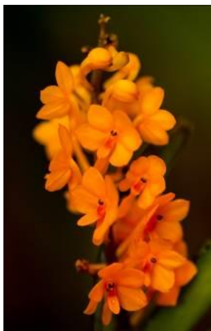
Vanda miniata ( Ascocentrum miniatum)