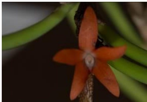
Ceratostylis rubra Marc Gray