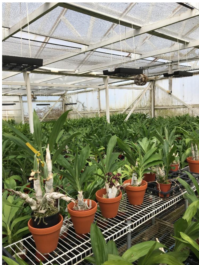
The Catasetum Greenhouse

We visit family in the San Diego area fairly frequently, so another visit to Sunset Valley is in our future. If you happen to be in that part of the country I recommend a visit- if not you can visit their website to get a glimpse of the results of Fred's hybridizing.