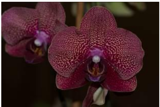
Phalaenopsis La Costco Carol Steiner