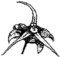
Greater Whorled Pogonia Official Club Flower

Monthly meetings are the 2nd Sunday of each month except for the month of August . We usually meet at The Munson Memorial Library, 1046 South East Street, Amherst, MA. Meetings start at 2pm. Beginner programs occasionally start at 1:30pm.