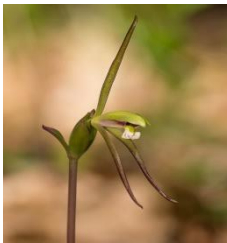
Greater Whorled Pogonia