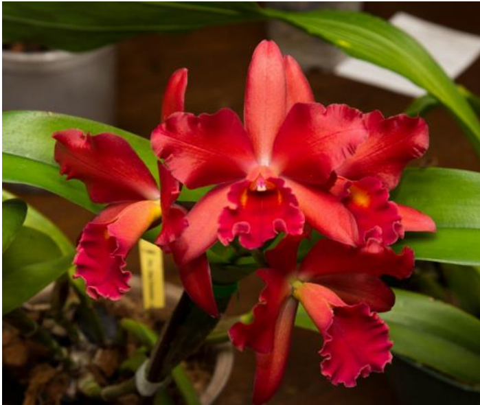
Rhyncattleanthe Love Triangle Ed deVarenes