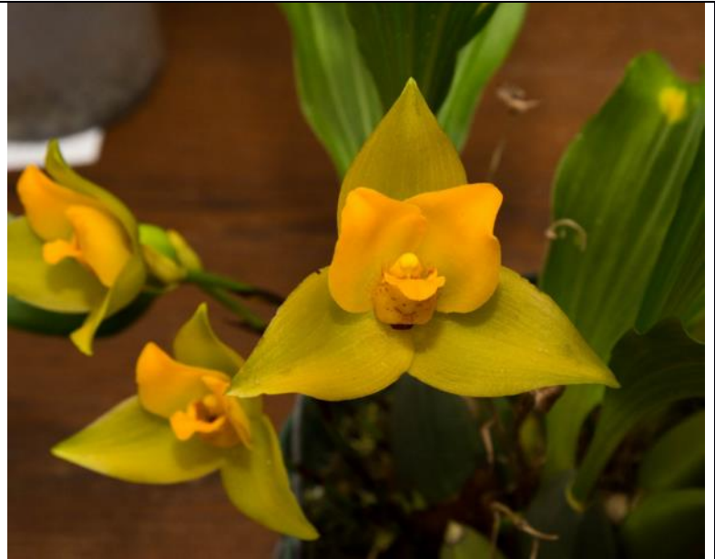
Lycaste aromatica