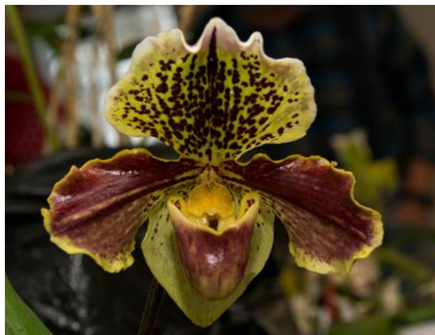
Paph. Quasky 'Diane' Marc Gray

The show table was lacking in the usual number of hanging plants but there was a great deal of color dominated by some cattleyas. The club will be participating in the upcoming Cape show being held the end of January, plants would be appreciated. There is one big show in February and three in March.