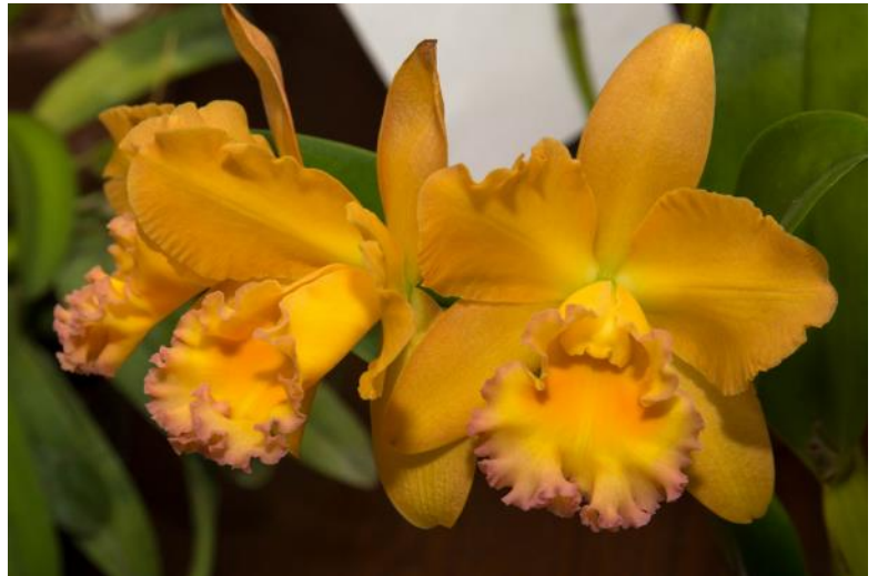
Rlc Waianae Starburst 'Volcano Queen' Roger West