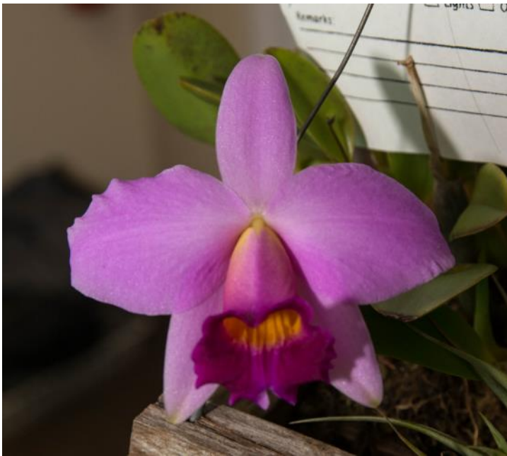
Cattleya praestans