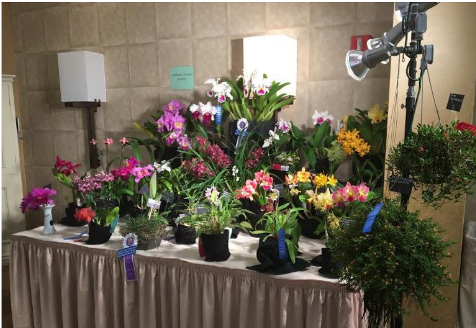
Amherst display at the Cape and Islands Show

The display table was colorful and full despite plants being held back for the upcoming Cape show. A lively auction of four orchids was the highlight of the meeting. We will have a February meeting prior to fine tune things for the show. Marc hinted that he is putting a show display with pictures of awarded orchids that the members have attained. I have seen these and it should be colorful and fill in blank spaces on the show floor. Lastly, we need everybody’s plants to fill in the club center display.