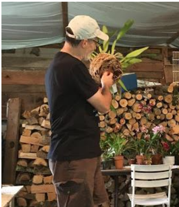
Impressive root system!