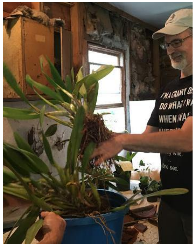
The plant put up a good fight but the humans prevailed, and a few lucky club members got to take a division home.