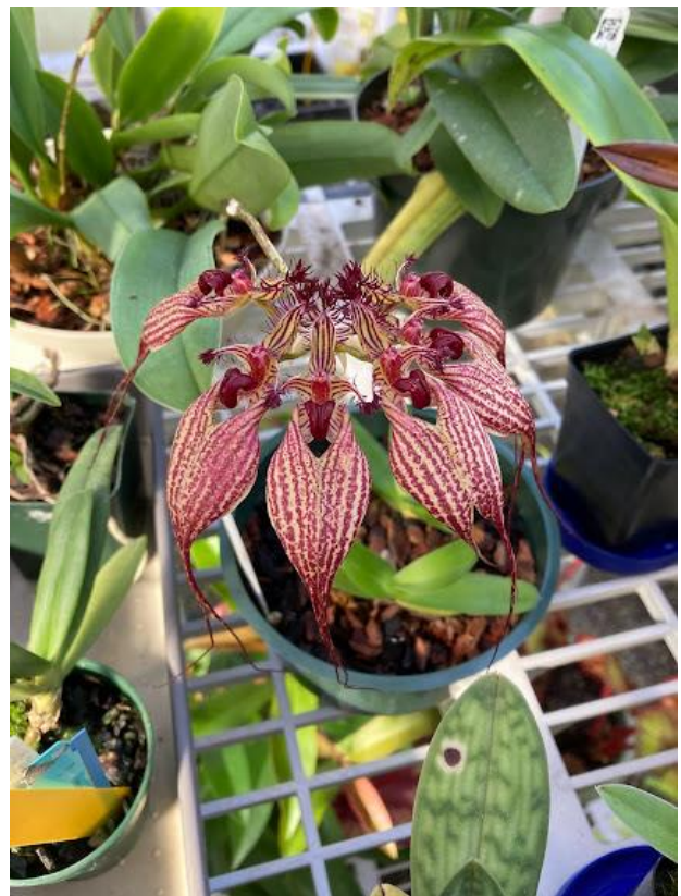
Bulbophyllum rothschildianum