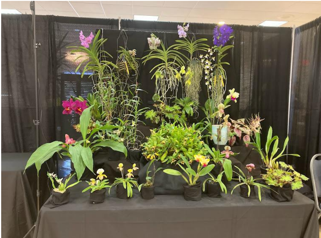
Amherst Orchid Society display at the 2021 Massachusetts Orchid Society Show