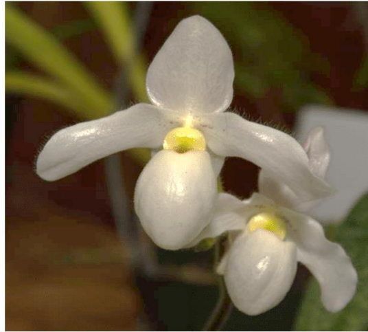
Paphiopedilum Deperle Lynn Reynolds Intermediate Windowsill