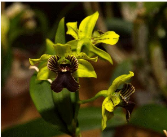
Dendrobium Green Flash Ed deV Sunroom