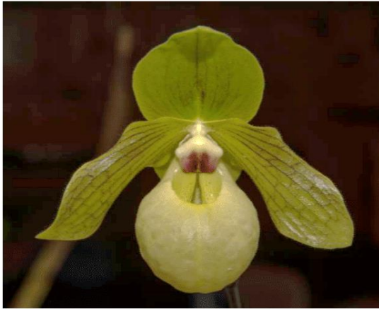
Paphiopedilum Envy Green Lynn Reynolds Intermediate Windowsill