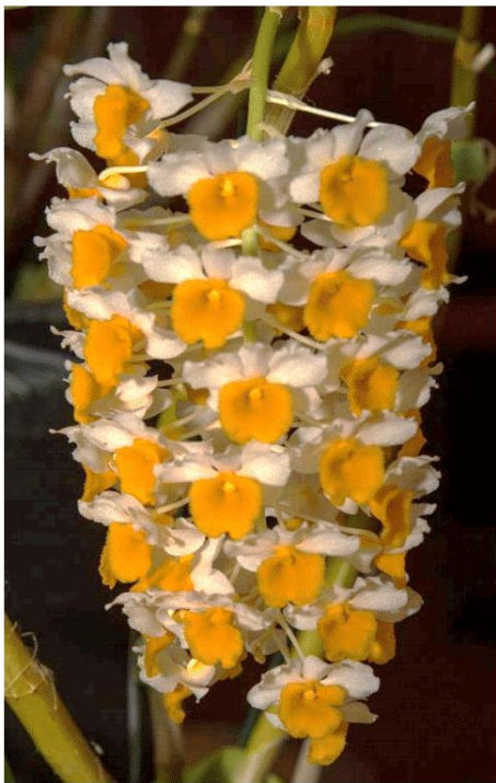
Dendrobium thyrsiflorum Marc Gray Greenhouse