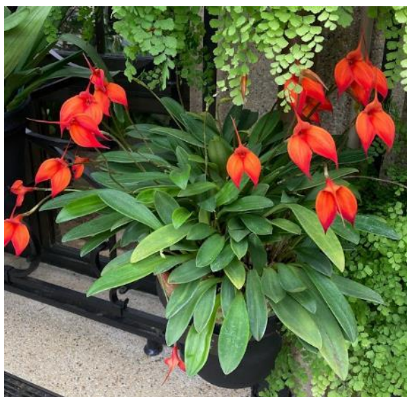
Masdevallia Heathii at Longwood Gardens