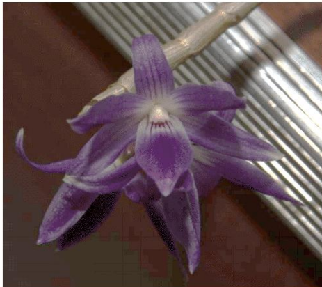
Dendrobium victoria reginae Steve Steiner Greenhouse