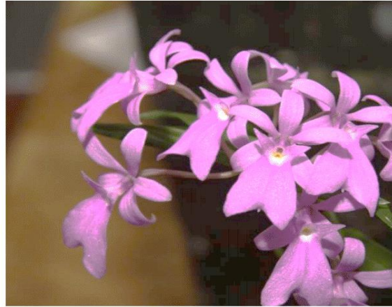
Epidendrum centropetalum Joseph Maciaszek Intermediate greenhouse