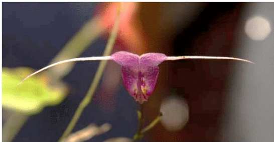
Scaphosepalum swertifolium