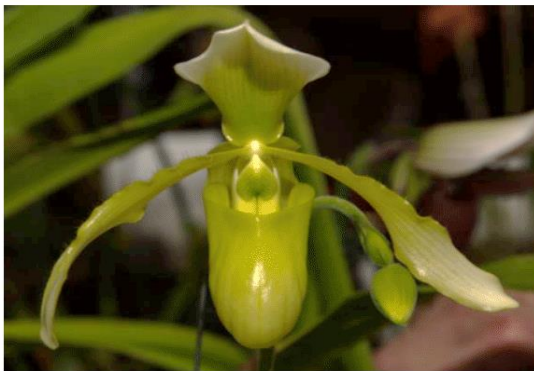
Paphiopedilum Yellow Fantasy Lynn Reynolds Intermediate Windowsill