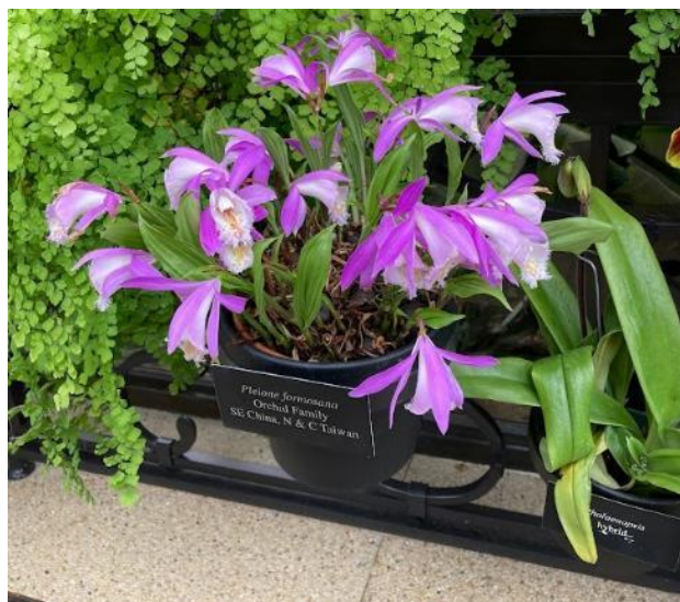
Pleione formosana at Longwood Gardens