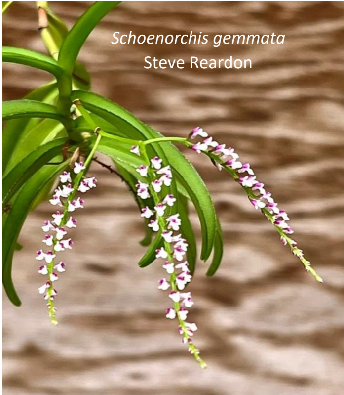
Schoenorchis gemmata