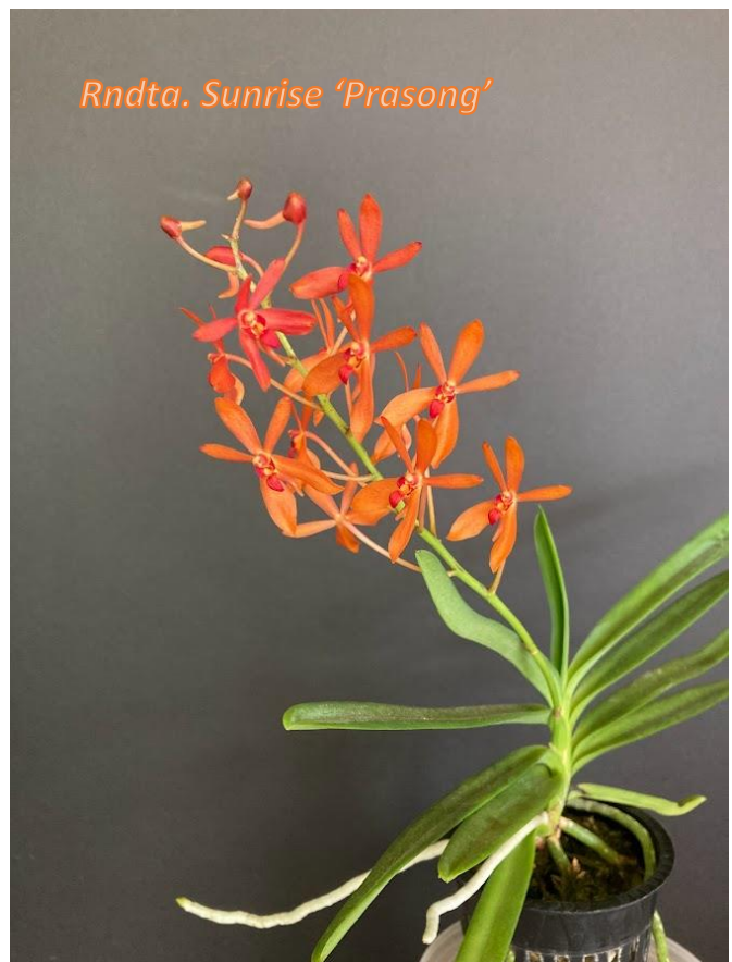
Rndta. Sunrise 'Prasong'