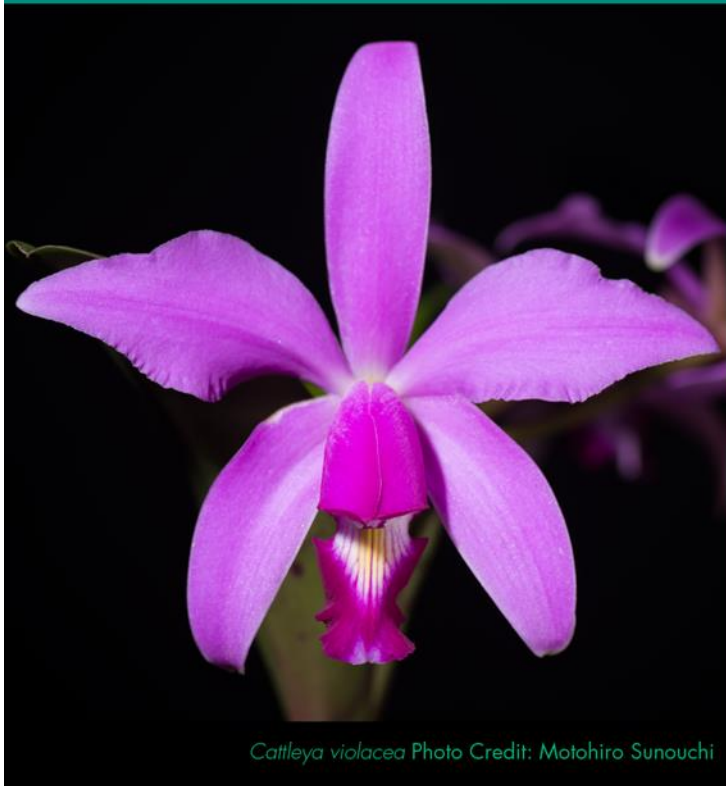
Cattleya violacea