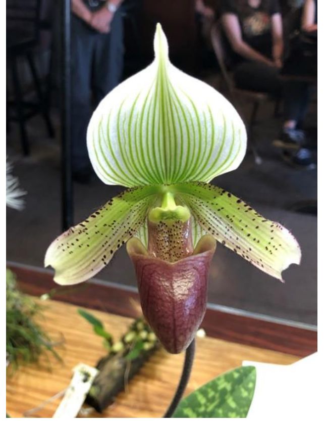
Paph Puna Moon Betsy Higgins