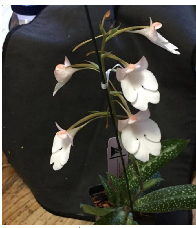
Habenaria carnea Marc Gray

Bulbophyllum microrhombus Dendrobium lawsii Encyclia vitillina Notylia escobarianum Paph dianthum Pleurothallis flexuosa