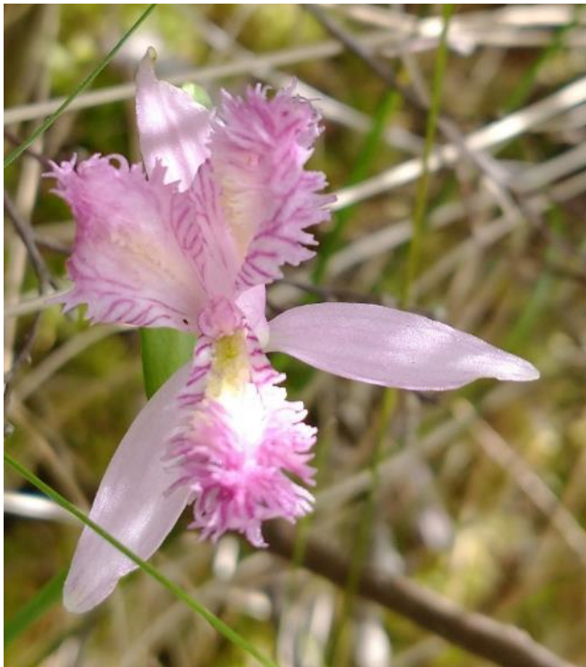
Pogonia ophioglossoides (peloric)