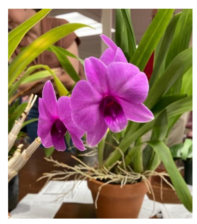
Den. Enobi Purple 'NN' Ed deVarennes