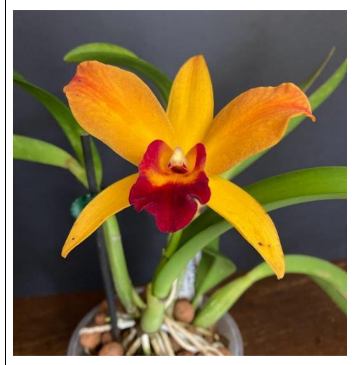
Pot. Golden Circle 'OPRL' x Lc. Tokyo Magic '6-1' Ed deVarennes