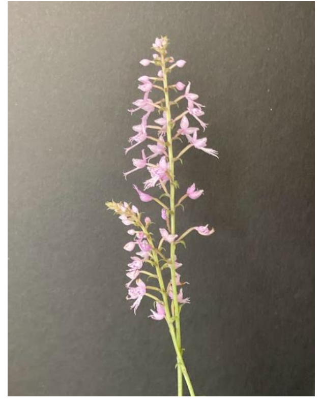
Stenoglottis longifolia