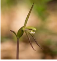
Greater Whorled Pogonia

An Affiliate of the American Orchid Society