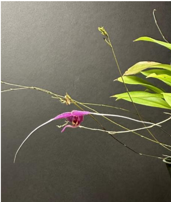
Scaphosepalum swertifolium