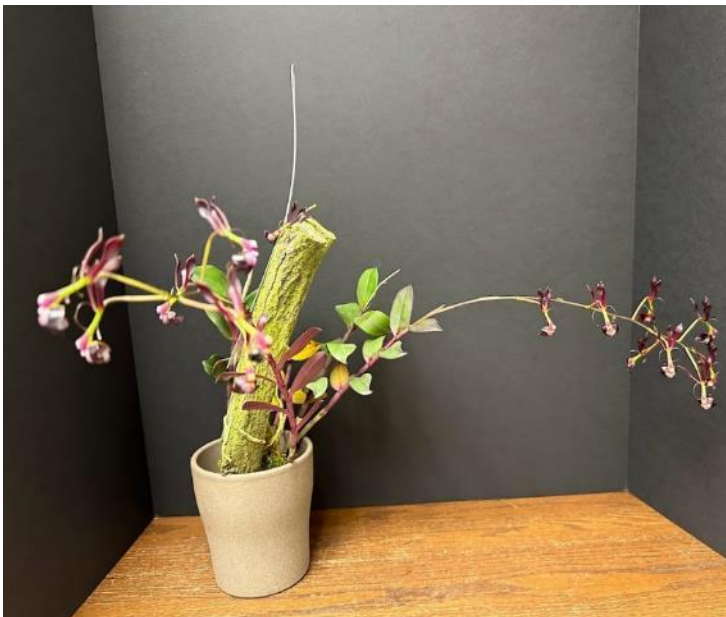
Epidendrum melanoporphyreum