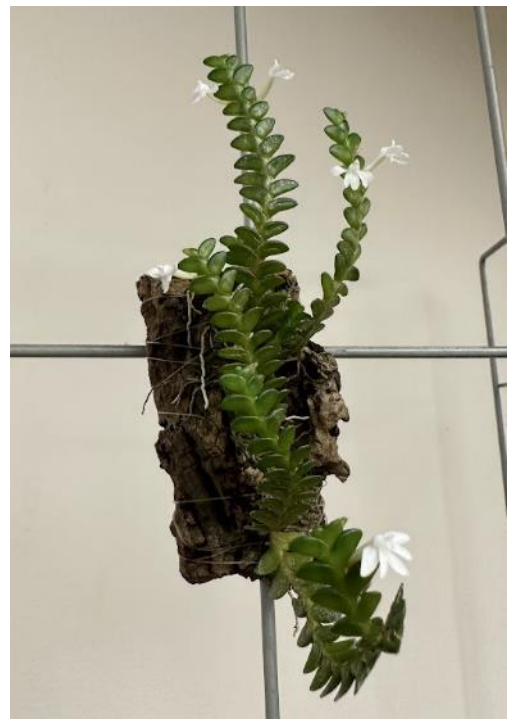
Angraecum distichum Zoe Loughman