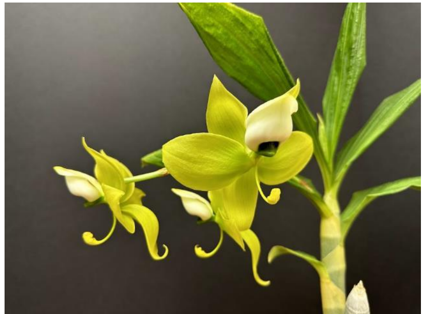
Cycnoches warszewiczii Zoe Loughman