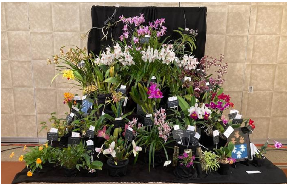
Amherst Orchid Society Display at the Cape and Islands Orchid Society show