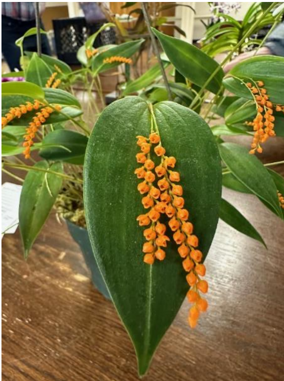
Pleurothallis truncata