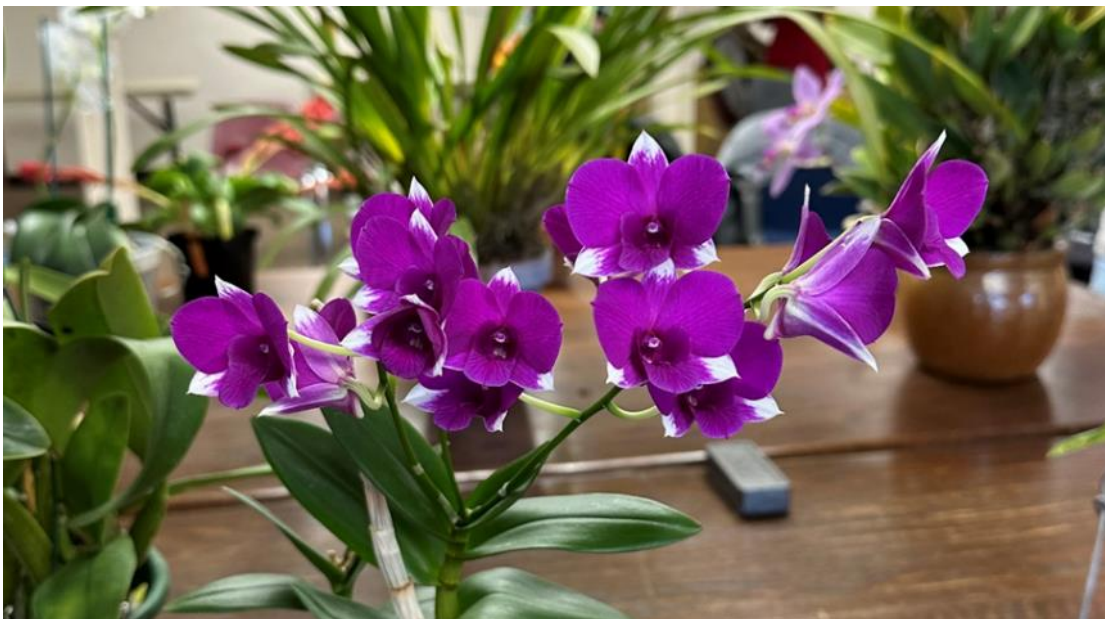
Dendrobium Venus Zoe Loughman

Type VI ( persistent ) warm growing all year. Restrict water twice during year. Examples: D. phalaenopsis , D. bigibbum , D. superbiens .