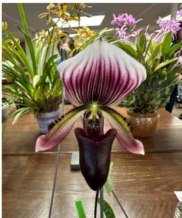
Paph callosum x maudiae Ann Jordan