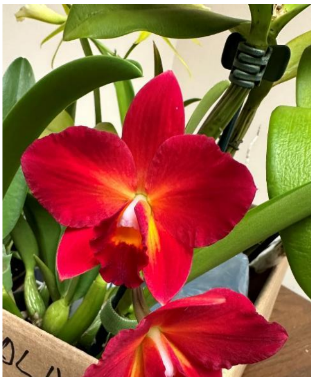
Rlc Exotic Valentine Stacy Soldato