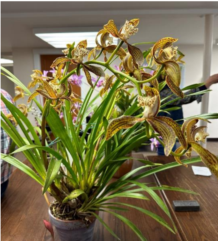
Cymbidium tracyanum