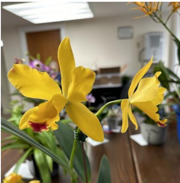
Blc Tropical Upgrade Zoe Loughman