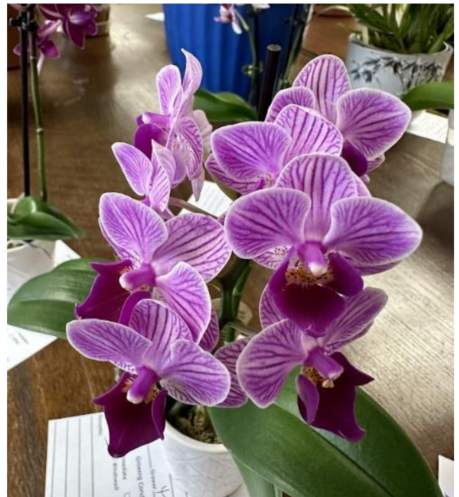
Phal No ID Marc Gray