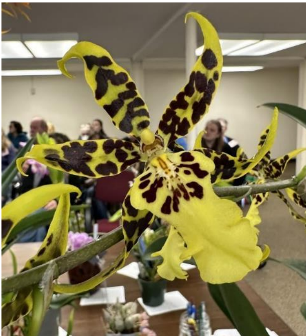
Brassidium Fly Away 'Miami' Judy Hudon