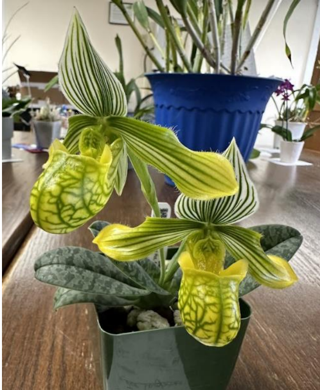
Paph venustum album Zoe Loughman