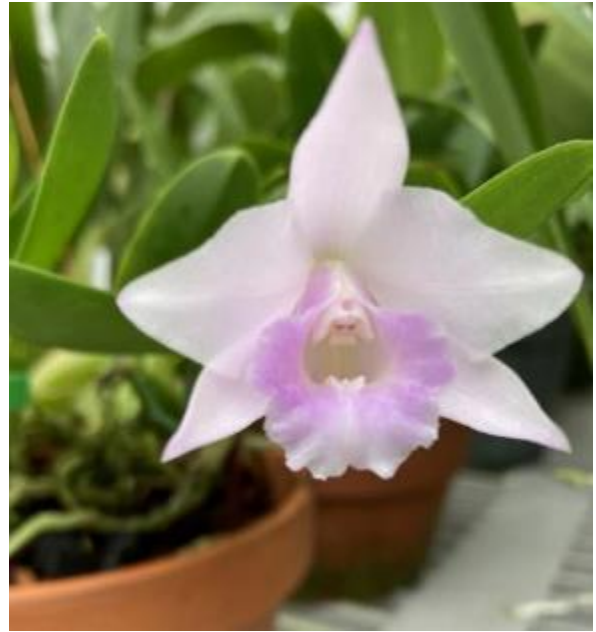
Cattleya alaorii