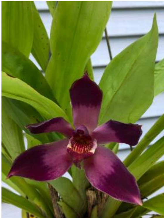
Pescatobollea bella OR Pescatoria Strawberry Fair Steve Steiner