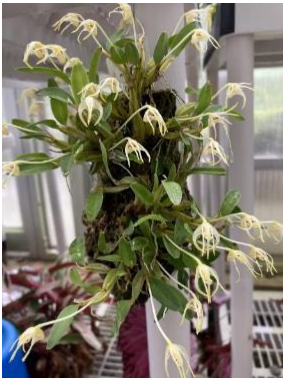
Diplocaulobium chrysotropis