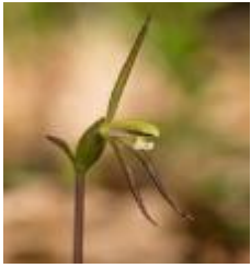
Greater Whorled Pogonia