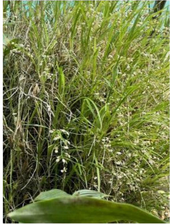
Gomesa radicans