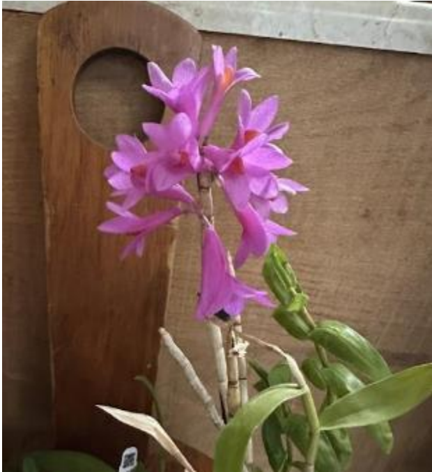
Dendrobium glomeratum Marc Gray