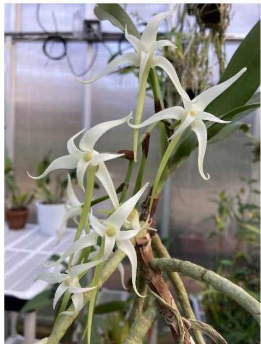
Cytorchis arcuata