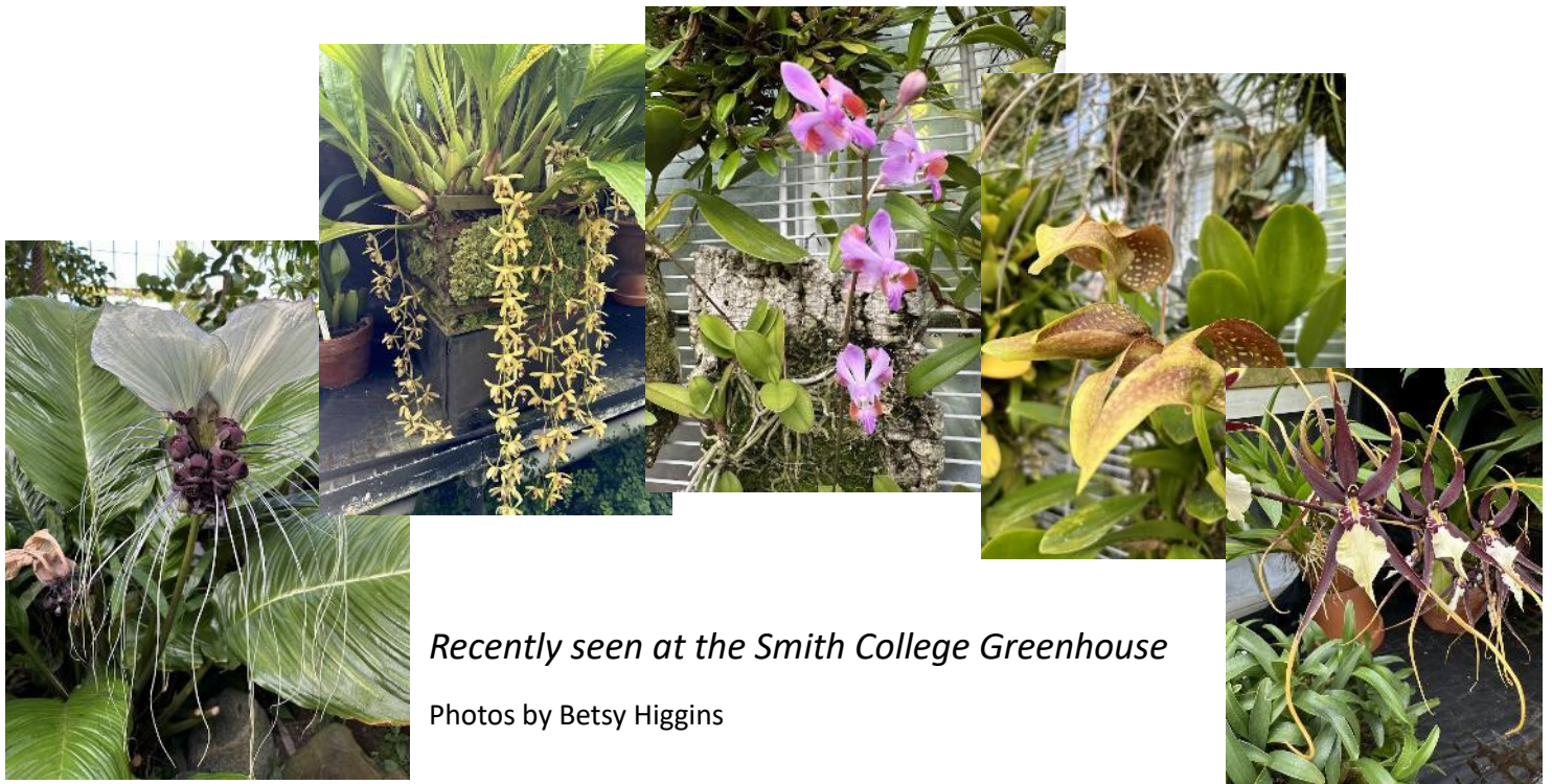
Recently seen at the Smith College Greenhouse