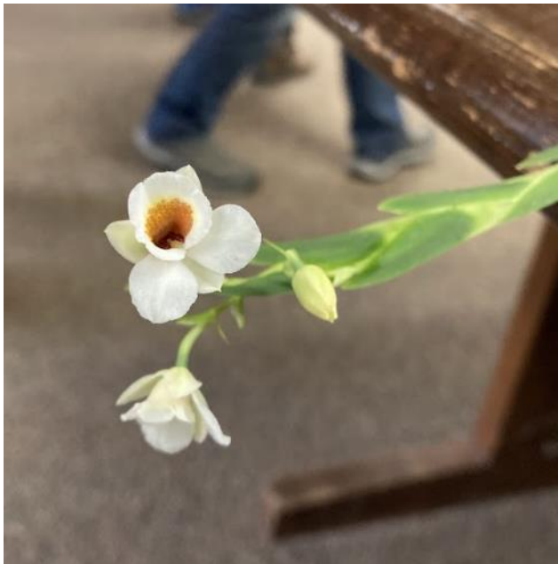
Lockhartia benetti