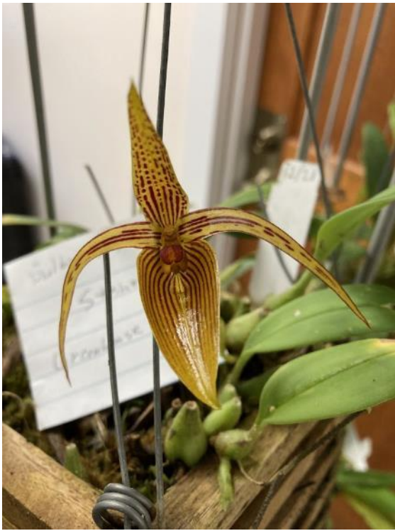
Bulbophyllum inunctum