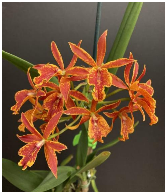
C. Volcano Trick 'Volcano Queen' Stacy Soldato