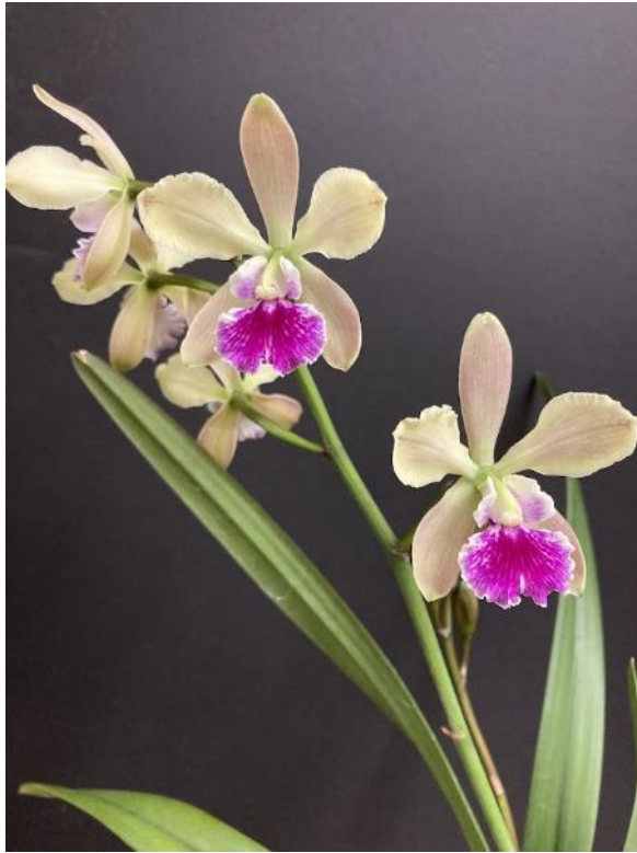
Epicattleya Serena's Tinkerbelle 'Paradise' Stacy Soldato