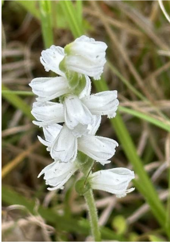
Spiranthes cernua Marc Gray