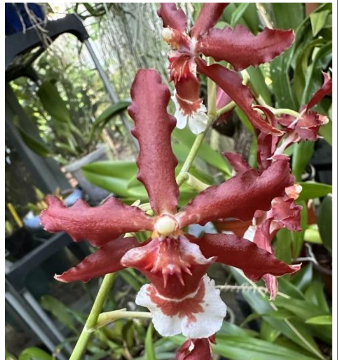
Oncidium No ID Betsy Higgins