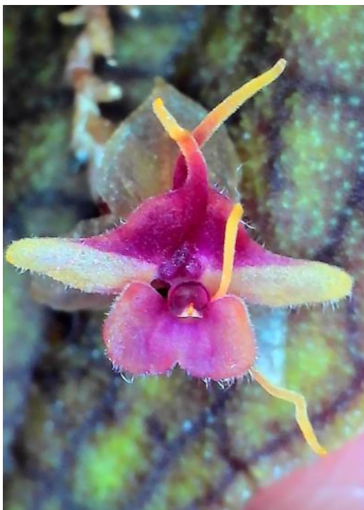
Lepanthes saltatrix Zoe Loughman