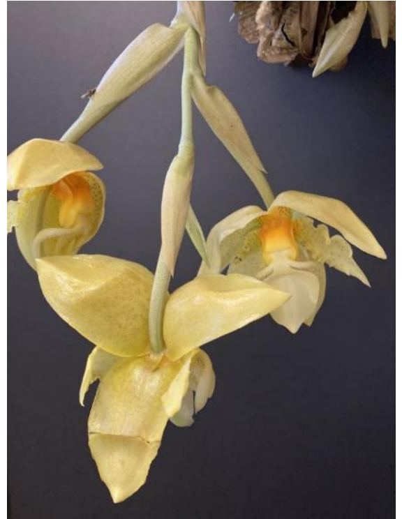
Stanhopea wardii