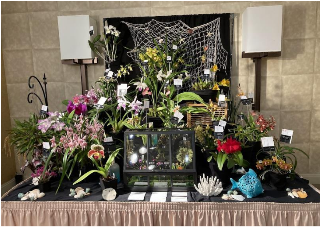
Amherst Orchid Society display at the Cape and Islands show