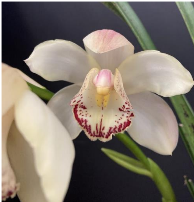
Cymbidium No ID Betsy Higgins