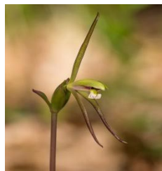
Greater Whorled Pogonia