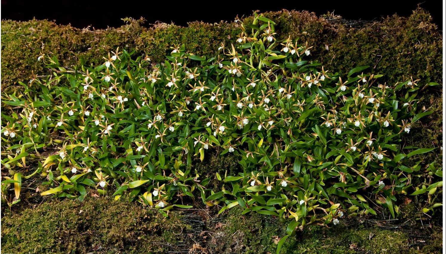
Dinema polybulbon 'Memoria Fred Morse' CCM/AOS.