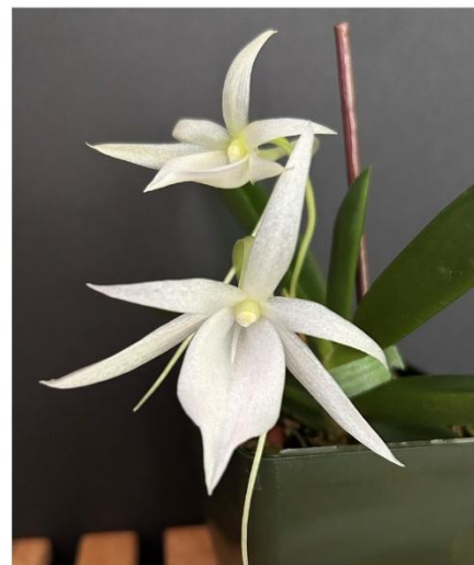
Photo credit: Liz Marinelli Photo credit: Liz Marinelli Photo credit: Liz Marinelli