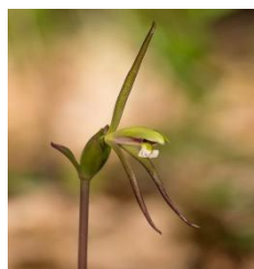
Greater Whorled Pogonia