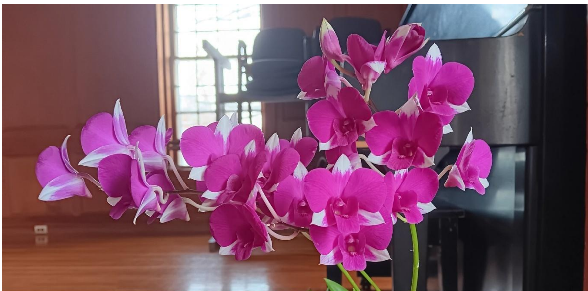
Dendrobium Noid 'Venus', Zoe