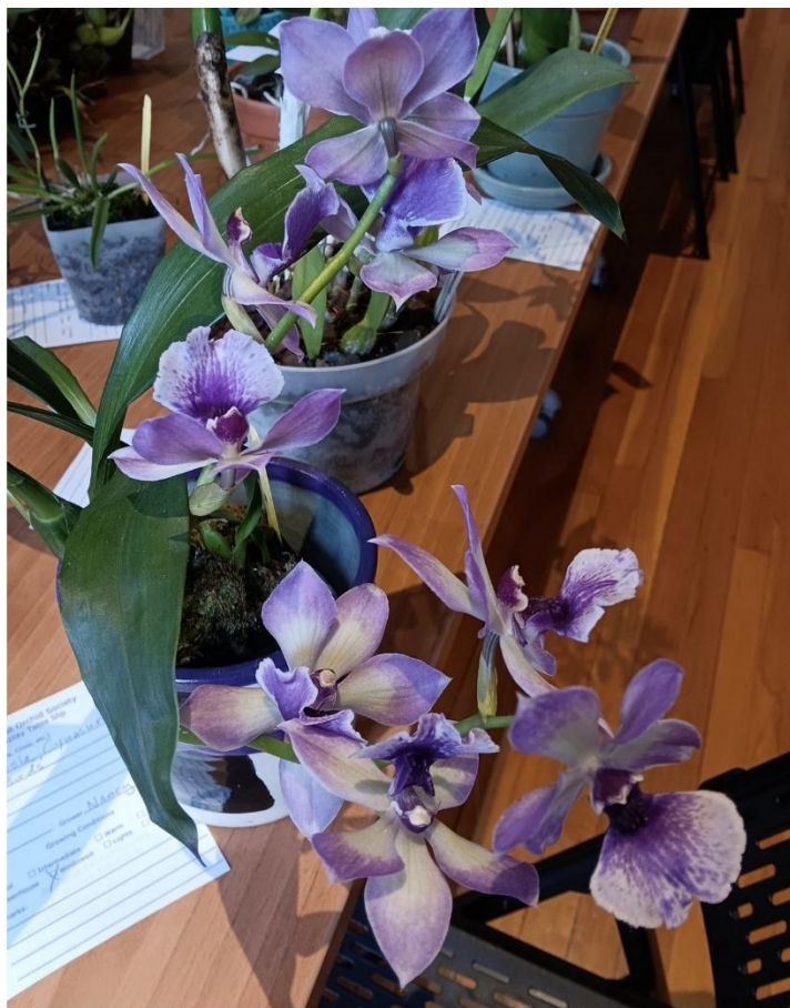
Zybonisia Cynosure 'Blue Birds', Nancy