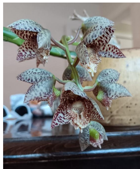
Ctsm. ivanae 'Purple Fantasy' x Ctsm. tigrinum 'SVO' I bought this at the orchid show this past February, it flowered in September, but I could not make it to the meeting that month.

Do you have a blooming orchid that will not be able to make it to a show table? Perhaps the flower is too delicate, possibly the weather is too cold to risk the plant, or maybe the darn thing refused to open until the day after our monthly meeting (they always know!). Send your pictures to Aimée at aimeehudon@gmail.com . We can still appreciate your orchid's beauty in the newsletter!