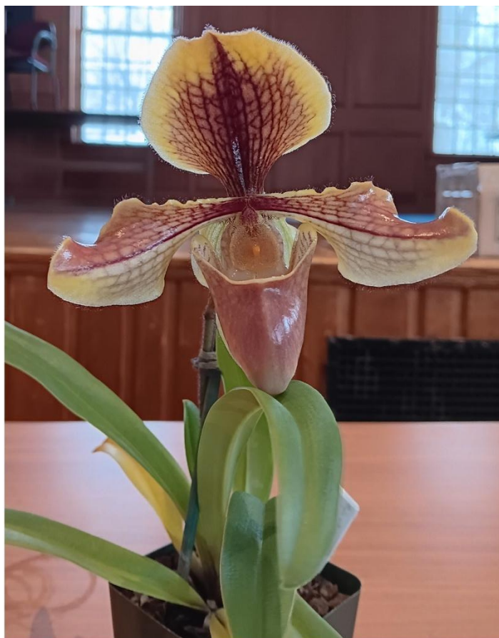
Paph villosum, Betsy