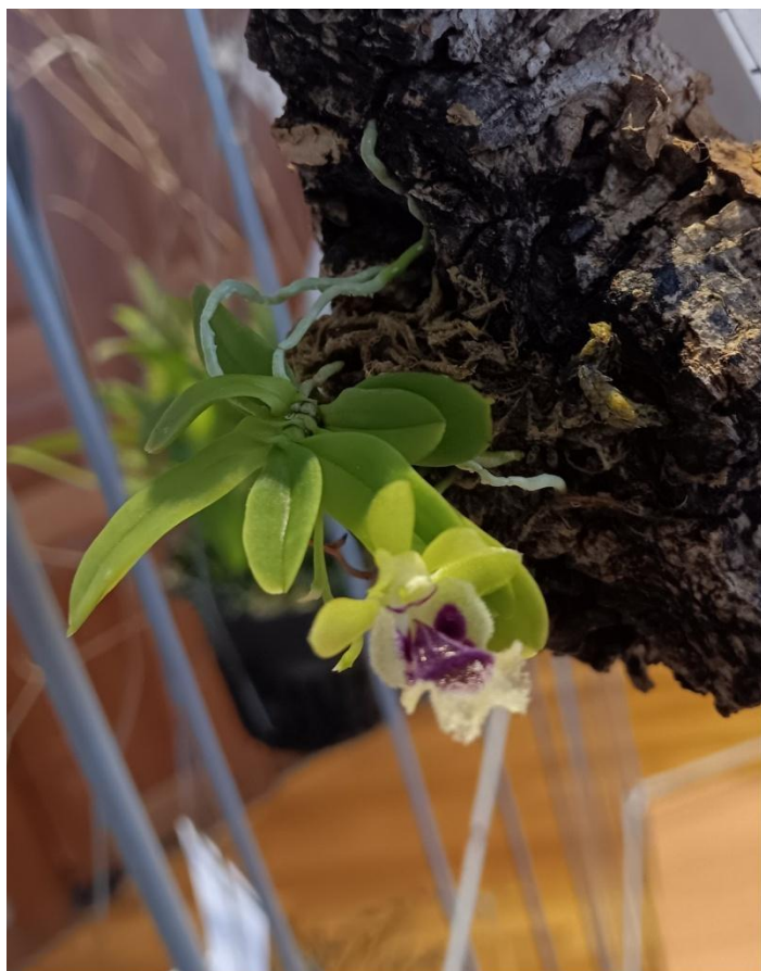
Haraella (Gastochilus) retrocalla